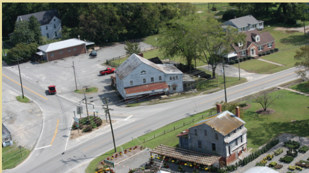
Above: Aerial view of Chuckatuck crossroads. (Drexel Bradshaw)

We are upgrading our website, ChuckatuckHistory.com , in format and capability to give users more information about the community and its surrounding history. It continues to be a work-in-progress as resources are available.